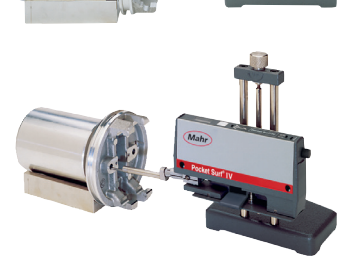
A wide selection of stands, accessories and applicationspecific probes are available